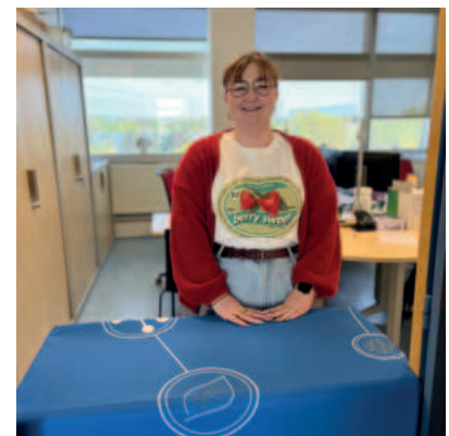
School's office D422

We're thrilled to tell you that the ESBS school's office has been refurbished! This is an opportunity to introduce you the "school's office desk", set up at the 1st door of the office to better welcome you and process your requests more efficiently. For any confidentiality request, it is still possible to enter the office during public opening hours → Monday to Friday from 8am to 1pm.